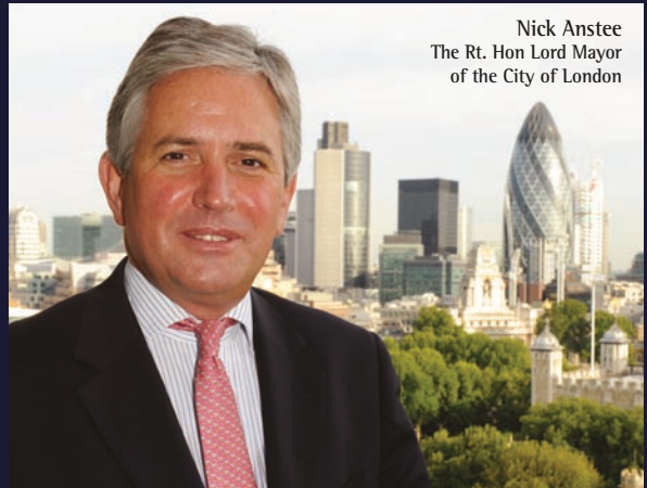
Nick Anstee The Rt. Hon Lord Mayor of the City of London

'...we at ICAP Energy believe that information and education are key to the development of new and innovative markets. We are therefore proud to sponsor this comprehensive training course.' - ICAP Energy